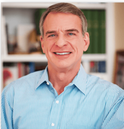
William Lane Craig

"More often than not, it is what you are rather than what you say that will bring an unbeliever to Christ. This, then, is the ultimate apologetic. For the ultimate apologetic is your life."